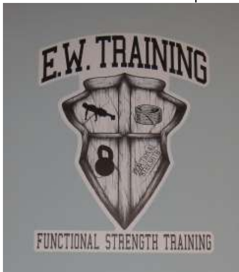
No one knows how much better I feel!

This morning after my workout I decided to give EWT a free plug in this newsletter. The only logo I found was on the wall so I took a picture.