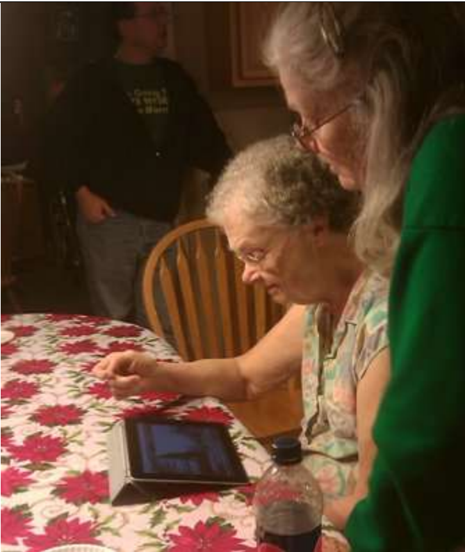
Need I say more?

Some wanted to see my new iPad. And you know how some of us like to show off our new toys.