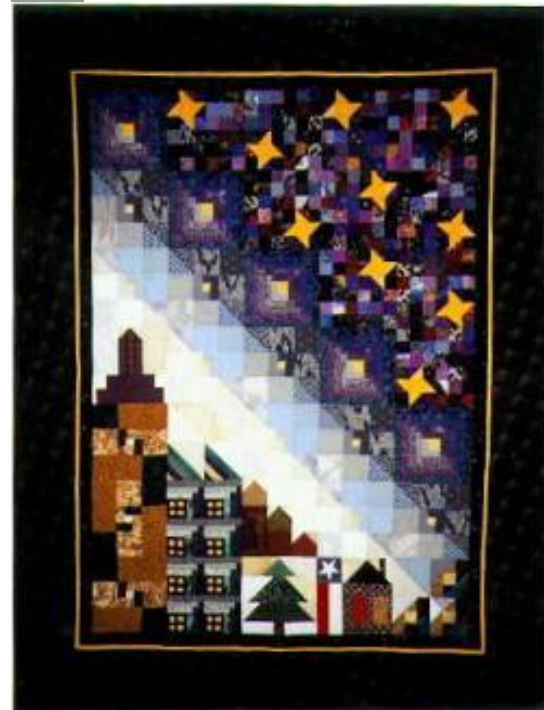
This is a quilt you can make in a one of the quilting classes at Sewing Concepts