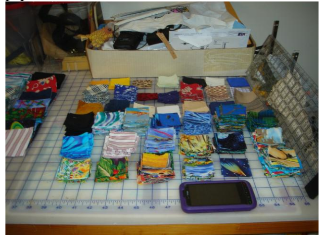
Here are some of those quilting blocks I cuts. Thursday I will be sewing some of them back together.

Well I added March birthday and there is still a lot of space left over. I guess I could put a couple pictures in the extra white space and leave the rest blank for you to use for scratch paper.